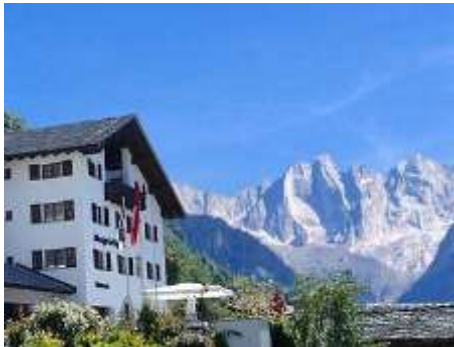
Hotel La Soglina, Soglio (CH Bergell)