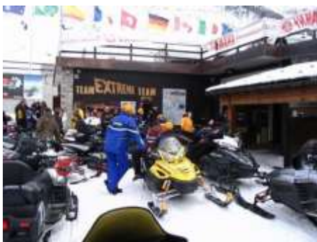
Our Snowmobile base, Madesimo