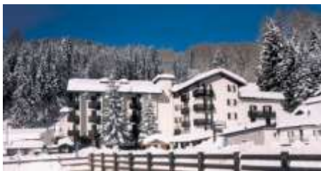
Hotel Andossi, Madesimo