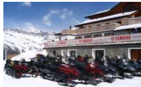
Mountain Restaurant Baitella